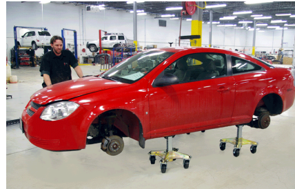
RapidGlide units roll very easily – when moving on a hill or incline always have assistance