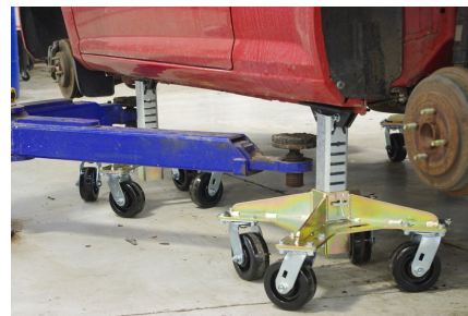
Load vehicle using floor jack, lift or overhead crane