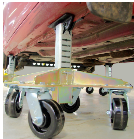
Make sure vehicle is fully seated in unit – load vehicle on level surface